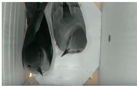
Orville & Lucy

We became concerned that what ever was bothering the birds about the box might prevent them from nesting. We can only speculate at the problem. Did the infrared lights and camera resemble a predator? Were the lights giving off a glow of any sort? Was the nest box entrance