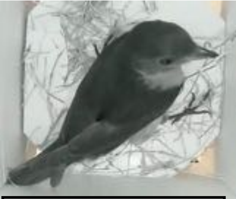
View inside the nestbox