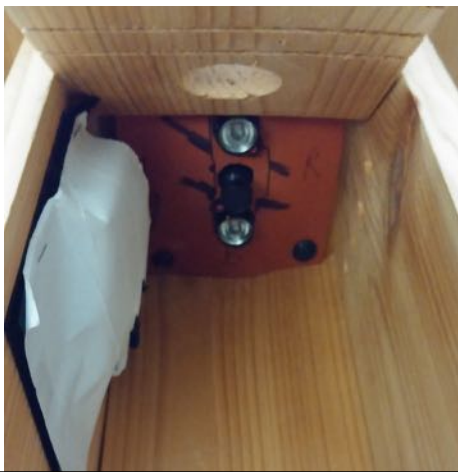
View inside the nestbox. Raspberry Pi computer attached to the side panel, camera and two infrared lights attached to the roof.