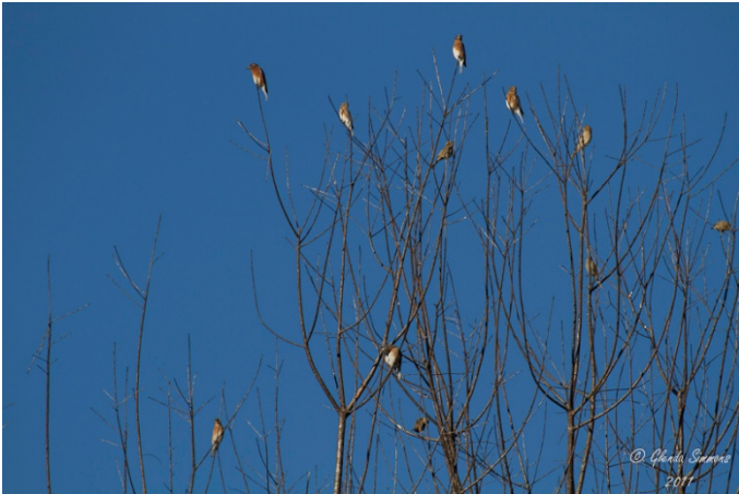
Six Bluebirds and their Buddies