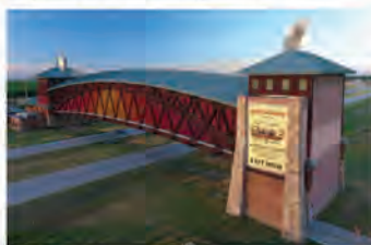
The Prairie Culture tour includes a stop at the Archway monument and museum.

Lunch for both field trips will be at Burchell's White Hill Farmhouse Inn ( burchellfarmhouseinn.com ).