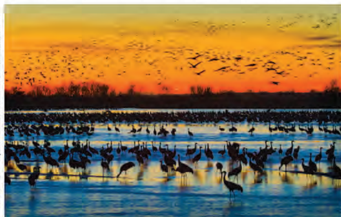
Sandhill Cranes converge upon the Platte River

But wait, there's more! Much more! The conference also includes workshops, educational exhibits, live and silent auctions, a raffle, vendors, and fun socializing with new and old birding friends. Dinners on Friday and Saturday will include a cash bar. In addition to Friday's live auction, we'll also be entertained